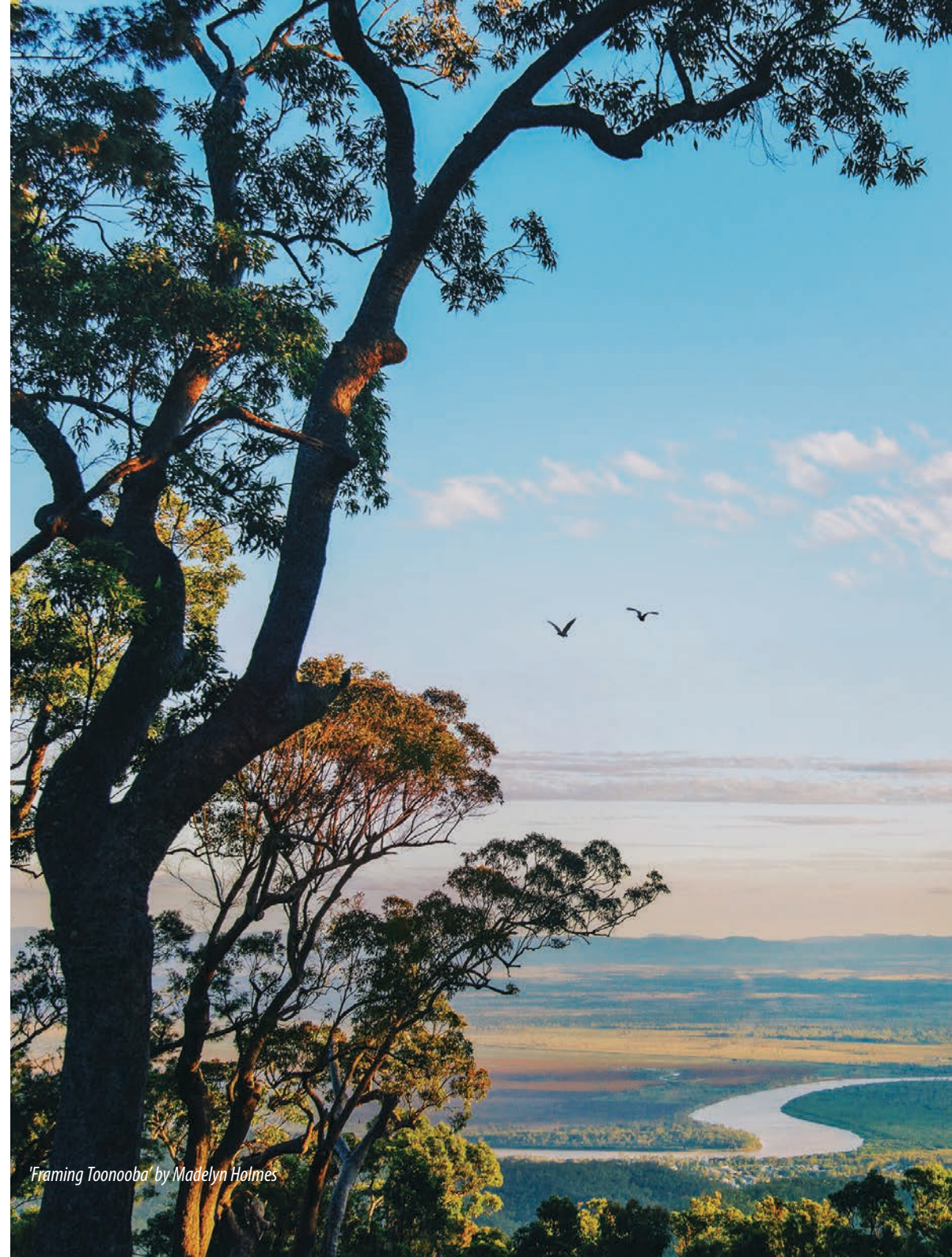
'Framing Toonooba' by Madelyn Holmes

Disclaimer: Information contained in this document is based on available information at the time of writing. All figures and diagrams are indicative only and should be referred to as such. While the Rockhampton Regional Council has exercised reasonable care in preparing this document it does not warrant or represent that it is accurate or complete. Council or its officers accept no responsibility for any loss occasioned to any person acting or refraining from acting in reliance upon any material contained in this document.